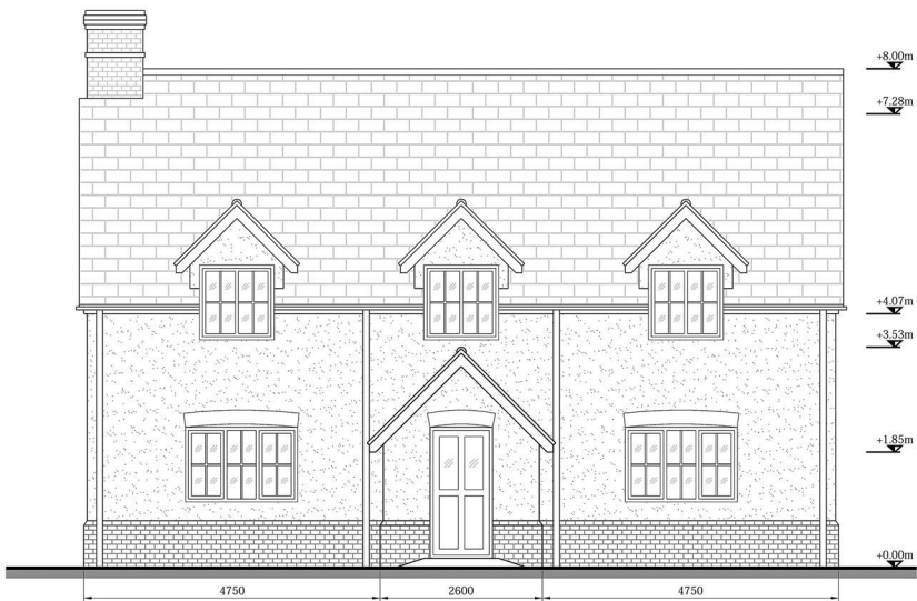
Front Elevation Scale 1:50