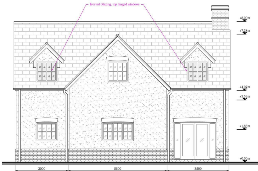
Rear Elevation Scale 1:50