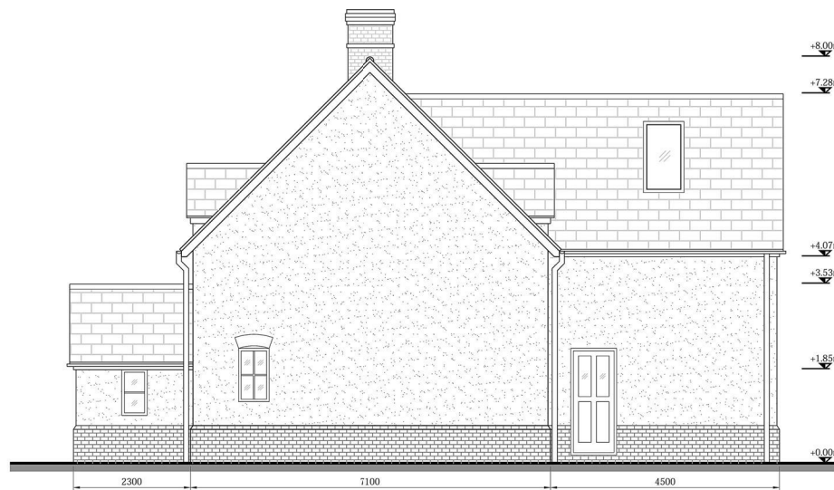
Right Elevation Scale 1:50