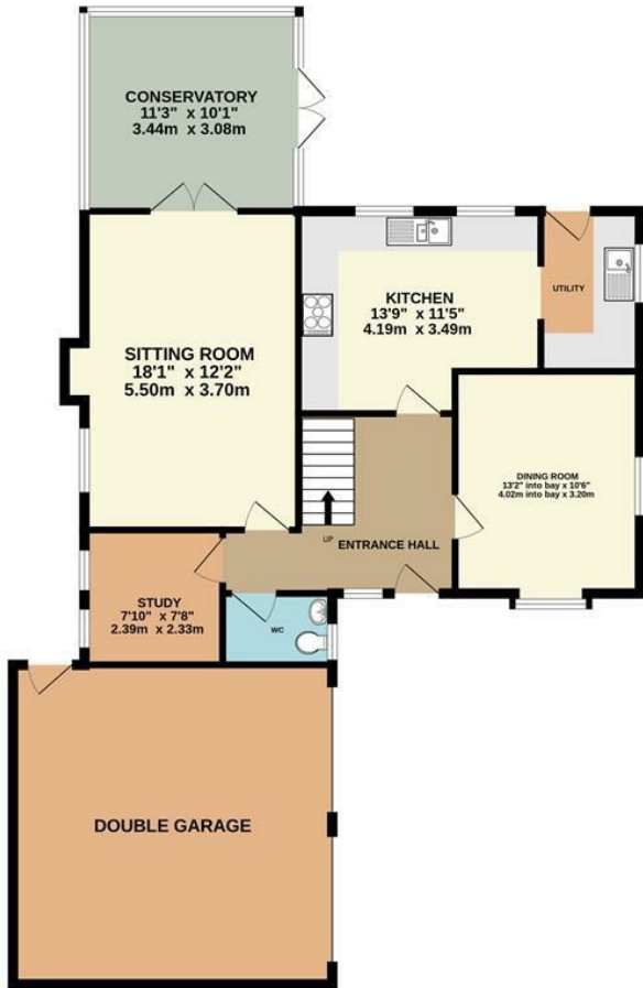
GROUND FLOOR 1208 sq.ft. (112.2 sq.m.) approx.