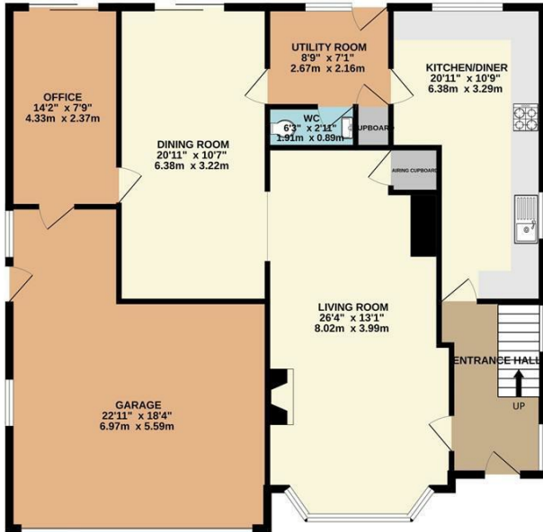
GROUND FLOOR 1347 sq.ft. (125.1 sq.m.) approx.